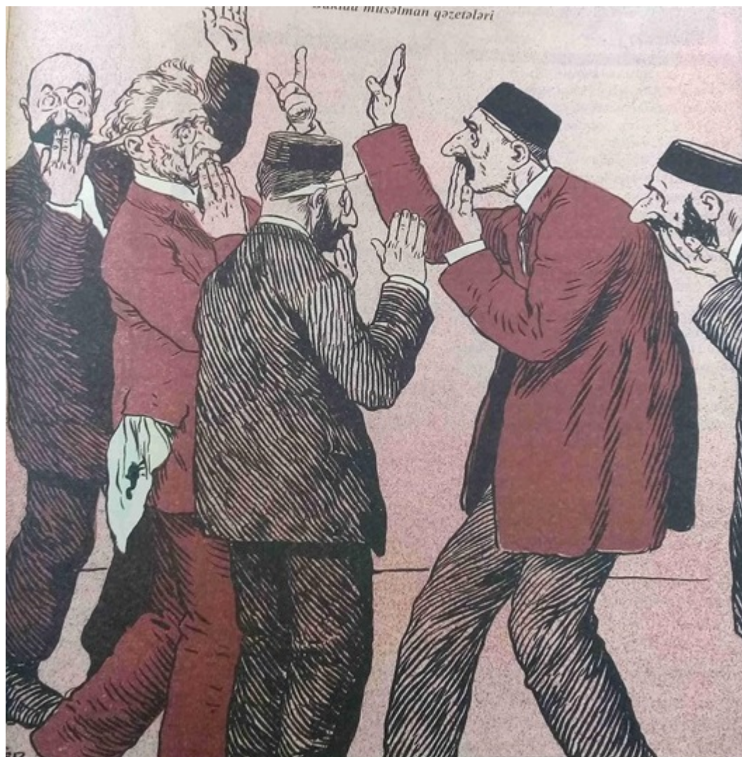
Muslim newspapers in Baku: